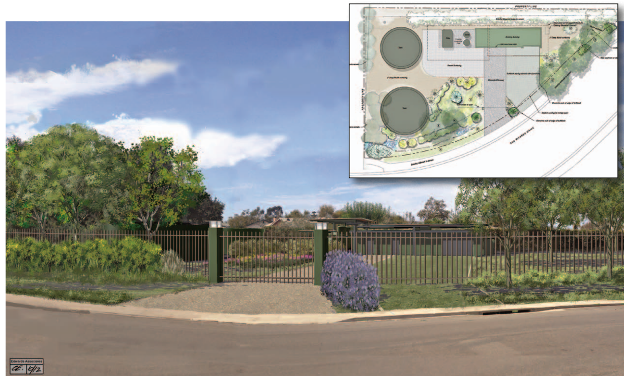
Artists rendering of the San Ricardo Well site with inset of site plan.

State Grant Saves Local Costs. The $1.65 million project is supported by a $400,000 State grant.